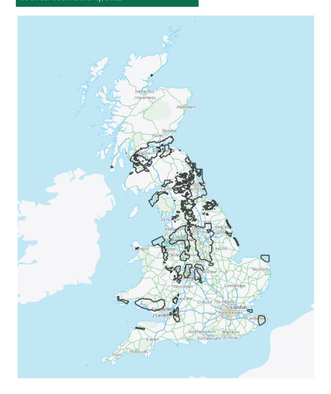
Figure 1: Map of reported coal mine entry points