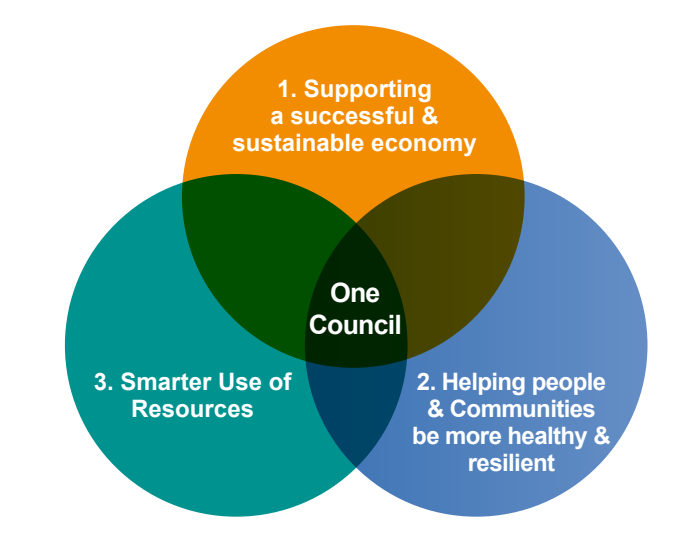
Figure 1: The Council's 3 Wellbeing Objectives