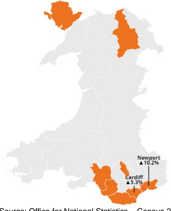
Figure 2: Local Authorities That Have Seen an Increase in Those Aged Under 15 Years, 2011 to 2021