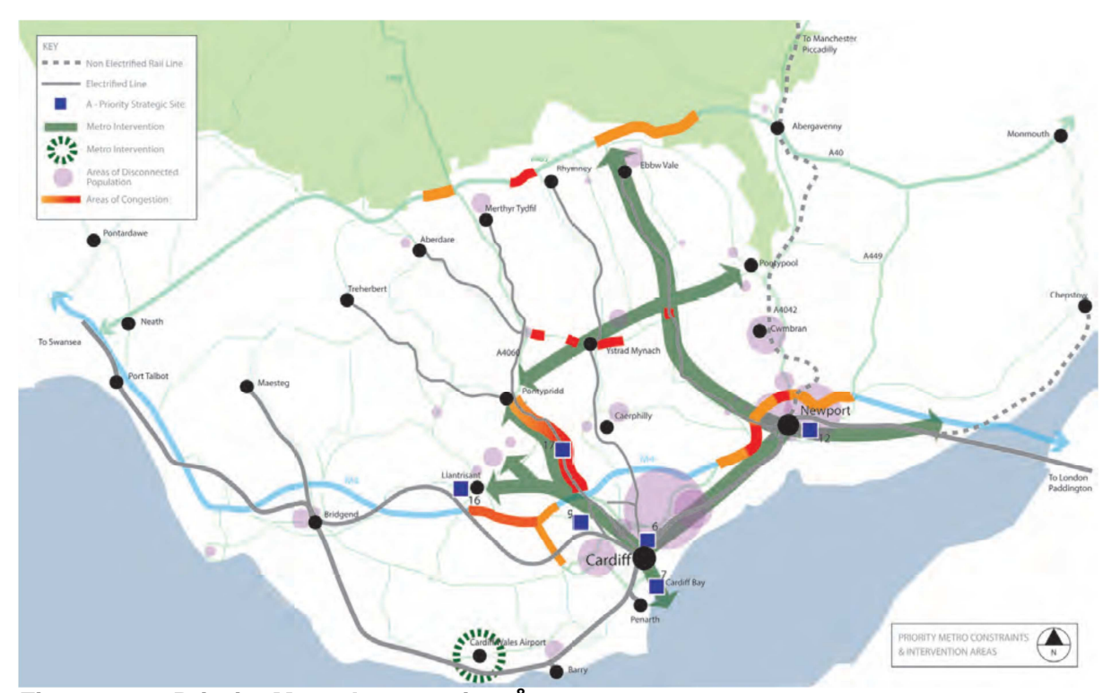
Figure 1.2 – Priority Metro Interventions<sup>8</sup>