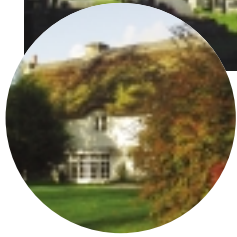
Left: Cottages at Merthyr Mawr

7 St. Teilo's Church 5 dates back to the middle of the 19th Century, and was built on an ancient site. Indeed stones have been found dating from the 5th Century suggesting there was an important Christian cemetery here.