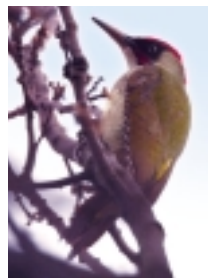
Green Woodpecker

Follow the road using the pavement where possible passing the church on your right hand side. When you get to the end of the road turn left - you are now on Nolton Street. Continue along the pavement then cross at the pedestrian crossing and retrace your steps to the railway station.