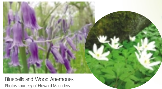
Bluebells and Wood Anemones

This wood saves lives! Imagine how uncomfortable life would be without food or shelter. Craig y Parcau provides these essentials for all sorts of animals and birds. In season you can hear Song Thrush, Blackcap and Chiffchaff. You may possibly also see and hear Green Woodpecker. In the spring the reserve supports lots of woodland flowers such as bluebell, wood anemone and yellow archangel which would suggest that this area has been woodland for a long time. It's now being run as a Local Nature Reserve to ensure that wildlife continues to thrive here.