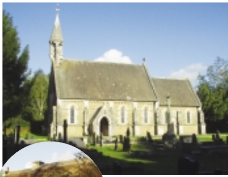
Above: Church of St. Teilo