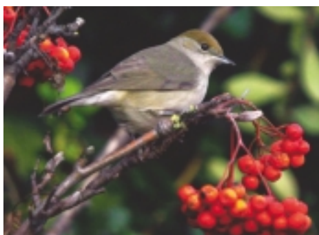
Female Black cap (NB The male has the black cap)

Keeping the river on your left continue along the path passing the tennis club on your right hand side along Church Road. Go through the subway where you will come out on Merthyr Mawr Road.