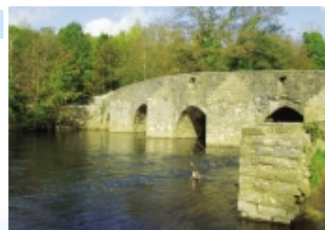
New Inn (dipping) bridge, Merthyr Mawr

To continue the circular walk, turn left and follow the road past the church in Merthyr Mawr Village.