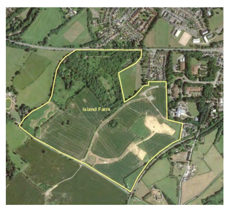
Figure 2.2: Island Farm Aerial Photograph