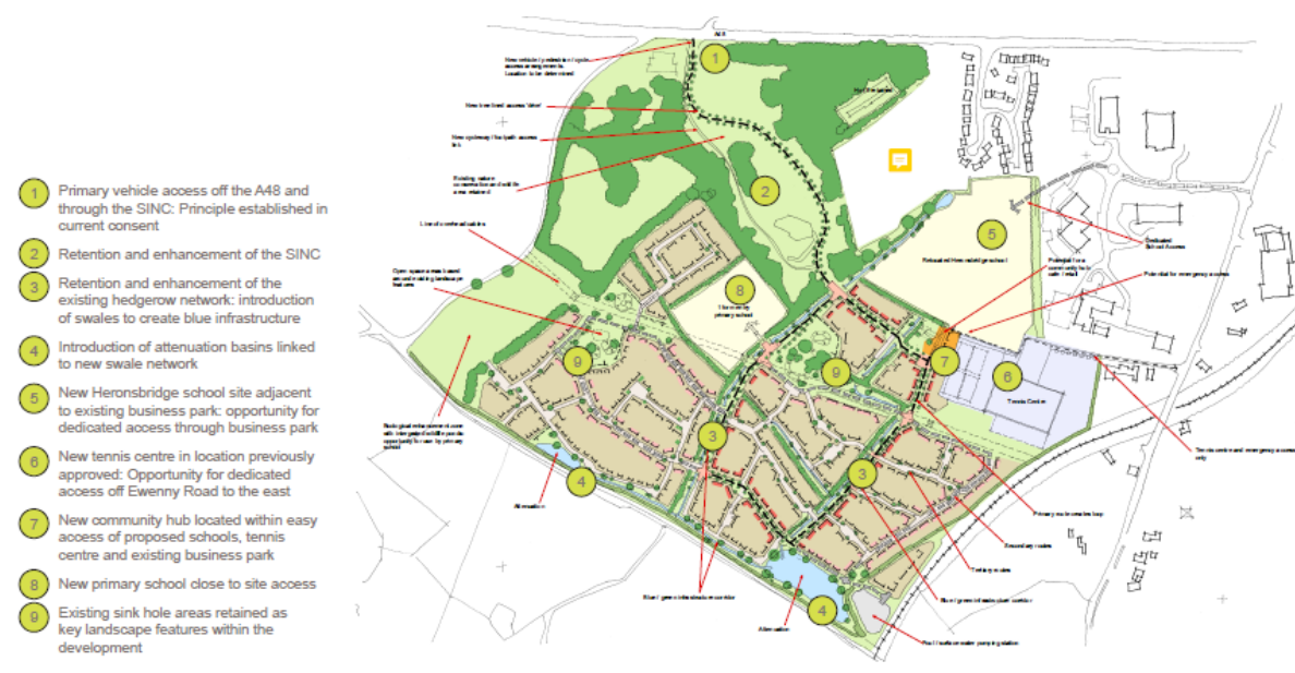
Figure 3.1: Island Farm Masterplan