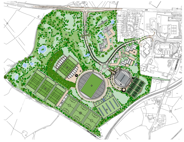
Figure 2.3: Sports Village Masterplan