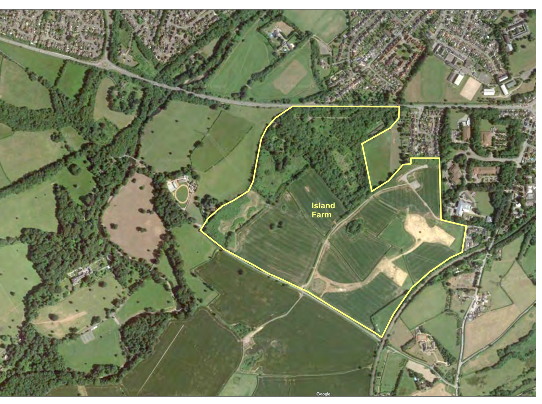
Site location plan

The development will strive to be low carbon by making optimum use of local renewable resources, the energy efficiency of its buildings and through an innovative site-wide energy strategy, including consideration of district heating options.