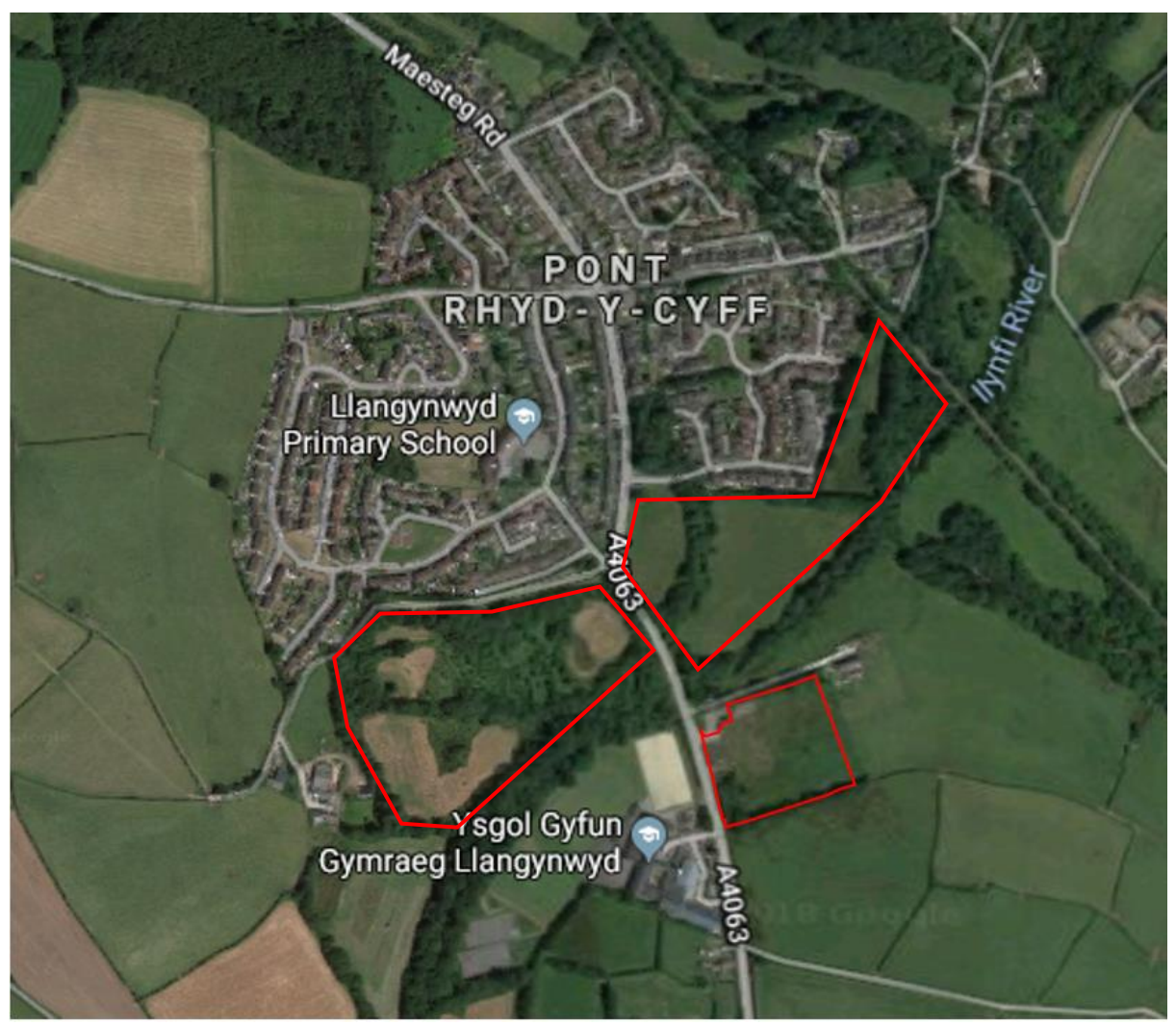
Site Context Showing Approximate Red Line Boundary of Site