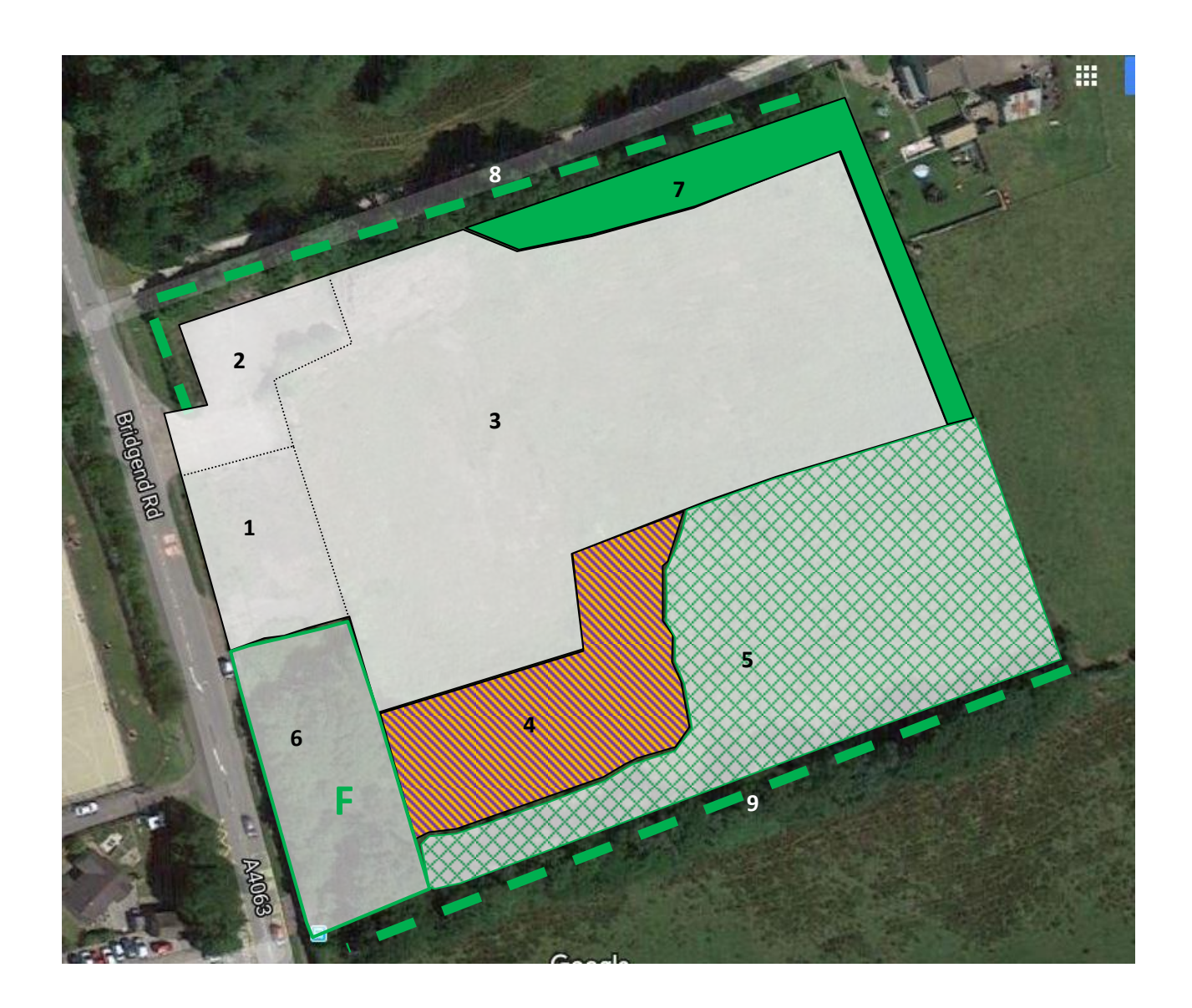
Fig. 15 Phase 1 Habitat Plan.