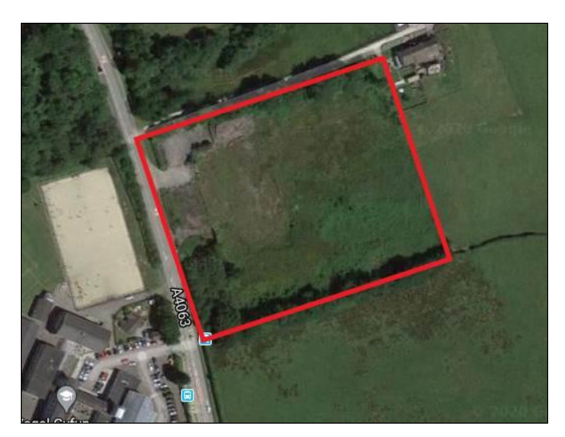
Figure 2. Area surveyed

3.2.4 The majority of the site is brownfield land, however the land at a higher level paralleling the hedgerow to the south and sweeping northward at the road frontage appears to be more natural in character. Much of the site is vegetated, except a small area of tarmac and concrete at the entrance-way.