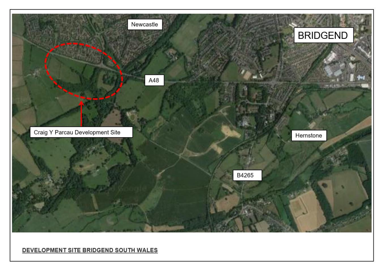
Fig. Appendix 1.1 Craig y Parcau