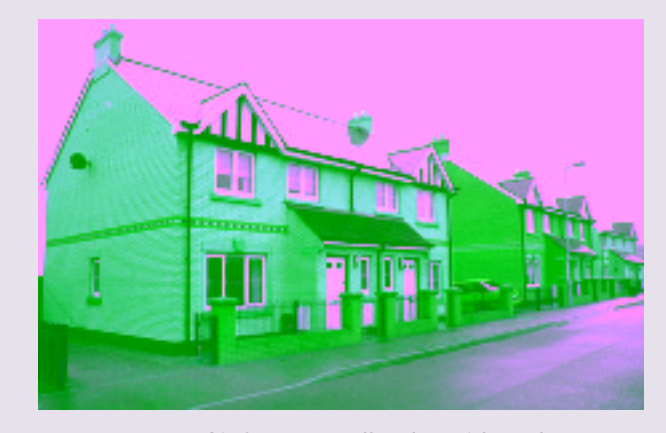
Bryn Cigfran, Broadlands, Bridgend Hafod Housing Association

By 2007 a further 16 rented dwellings will have been provided by the housing association on land outside of the original S106 Agreement, but again more centrally located.