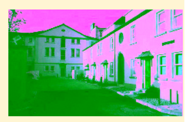
A Sense of Place - Gwalia Housing Society Cambrian Place, Swansea

offers an independent Design Service that provides objective advice on energy efficient and environmentally sound building design. The Energy Savings Trust (EST) works with households, business and the public sector to encourage more efficient use of energy and also promotes the use of small scale renewable energy technologies. The next section of this document references sources of further advice on design and sustainability issues as well as other research and good practice in the field of affordable housing.