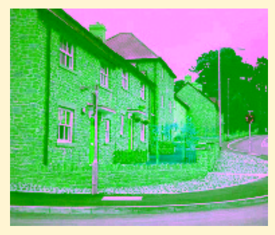
Cwrt Bannau, Crickhowell Wales and West Housing Association

to promote design practice that is compatible with the scheme made by the National Assembly for Wales under section 121 of the Government of Wales Act 1998 ("the Sustainable Development Scheme"), promoting best practice in energy efficiency, waste disposal and access to public transport;