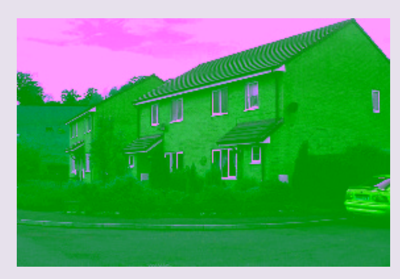
Affordable Rural Housing, Cymdeithas Tai Clwyd, Trem Yr Ysgol, Llangollen

The terms of this agreement helped the Association to acquire the land for the sum of £25,000 thus freeing up scarce SHG resources to provide additional housing elsewhere within the county.