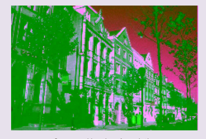
Swansea Housing Association Mixed Use Urban Regeneration, Wind Street, Swansea

The proposal is to create a mixed use 'urban village' using the WDA as 'agents to deliver the land free of encumbrances, since its passage through WDA ownership has the effect of cleansing title.