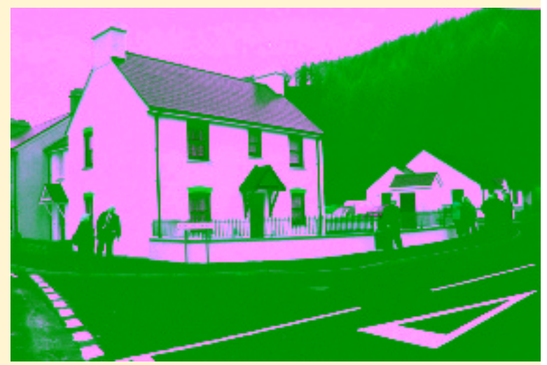
Parc yr Efail, Felindre Farchog Cymaeithas Tai Cantref