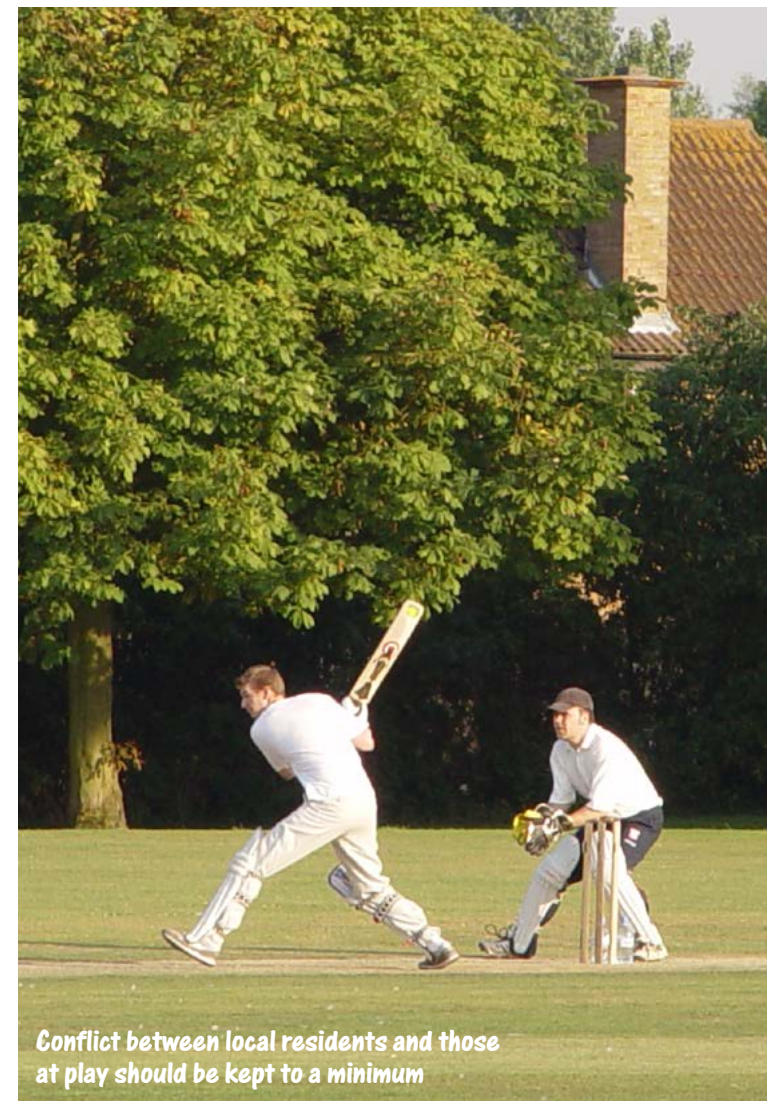
Conflict between local residents and those at play should be kept to a minimum

A suitable relationship can be created by using the minimum buffer zones for specific facilities. These off-set distances ensure that facilities do not enable users to overlook neighbouring properties, reducing the possibility of conflict between local residents and those at play.