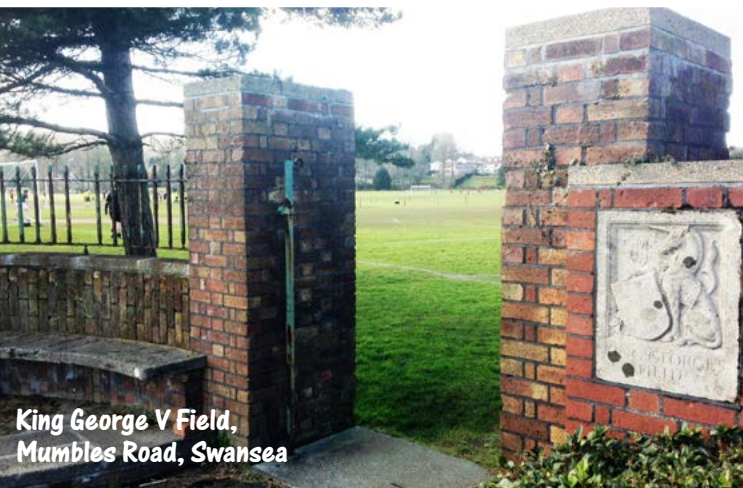
King George V Field, Mumbles Road, Swansea

Open space also plays an important role in meeting the challenge of climate change and flooding through integrating Sustainable Urban Drainage Systems (SUDS) and providing opportunities for conserving and enhancing the natural environment.