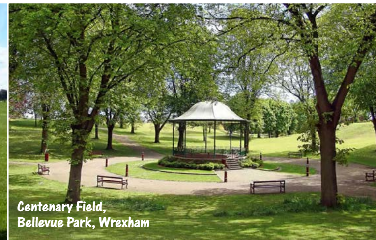
Centenary Field, Bellevue Park, Wrexham