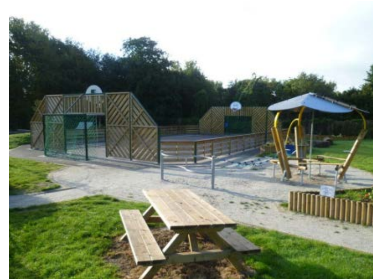
Equipped and designated play spaces should be in accessible locations and in close proximity to dwellings

Definitions can be found here for the open space and equipped/ designated play area typologies.