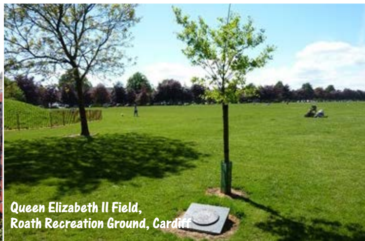
Queen Elizabeth II Field, Roath Recreation Ground, Cardiff