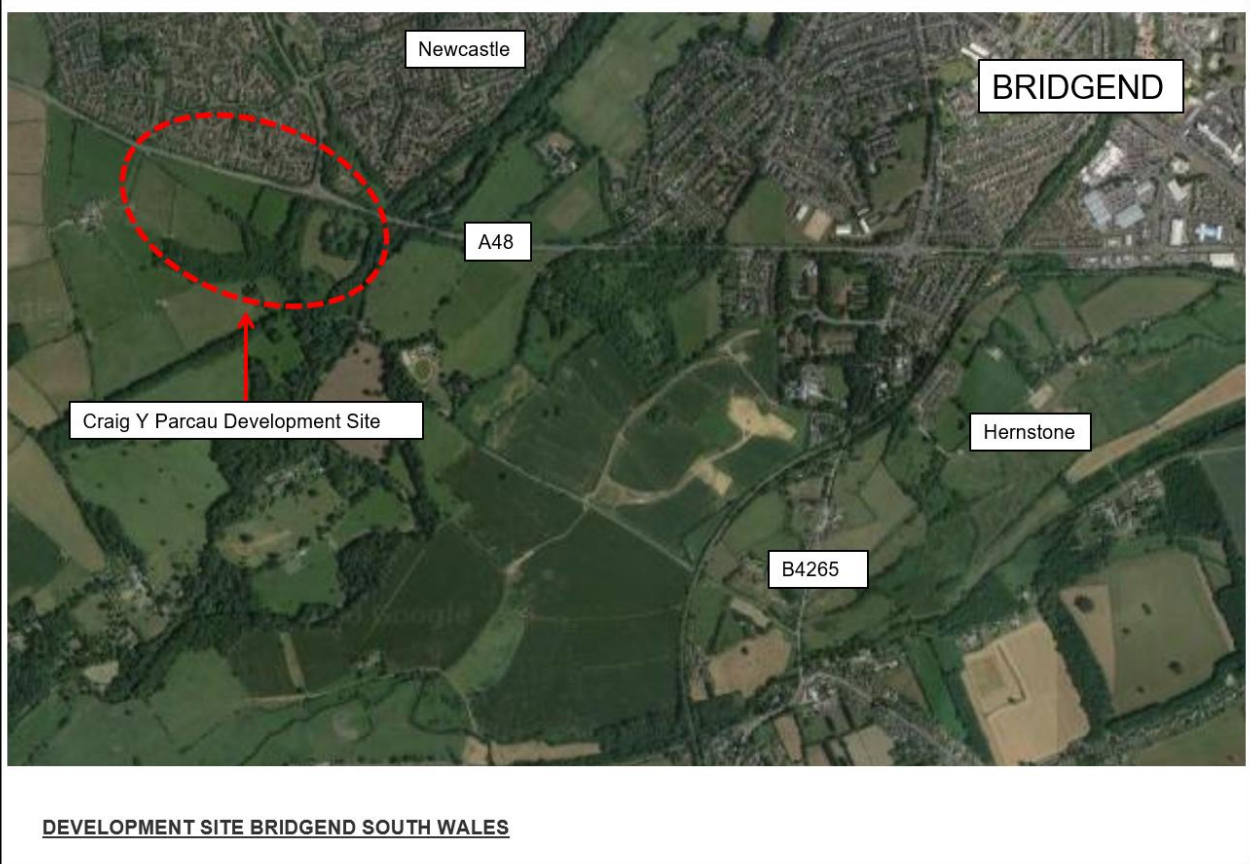
Fig. Appendix 1.1 Craig y Parcau